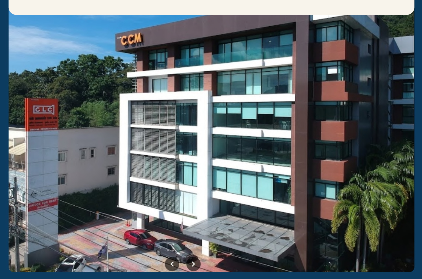
77/77 Unit 6D CCM Complex Moo 5 Chalermprakiat Rama 9 Ratsada Sub-District, Mueang Phuket District, Phuket 83000.